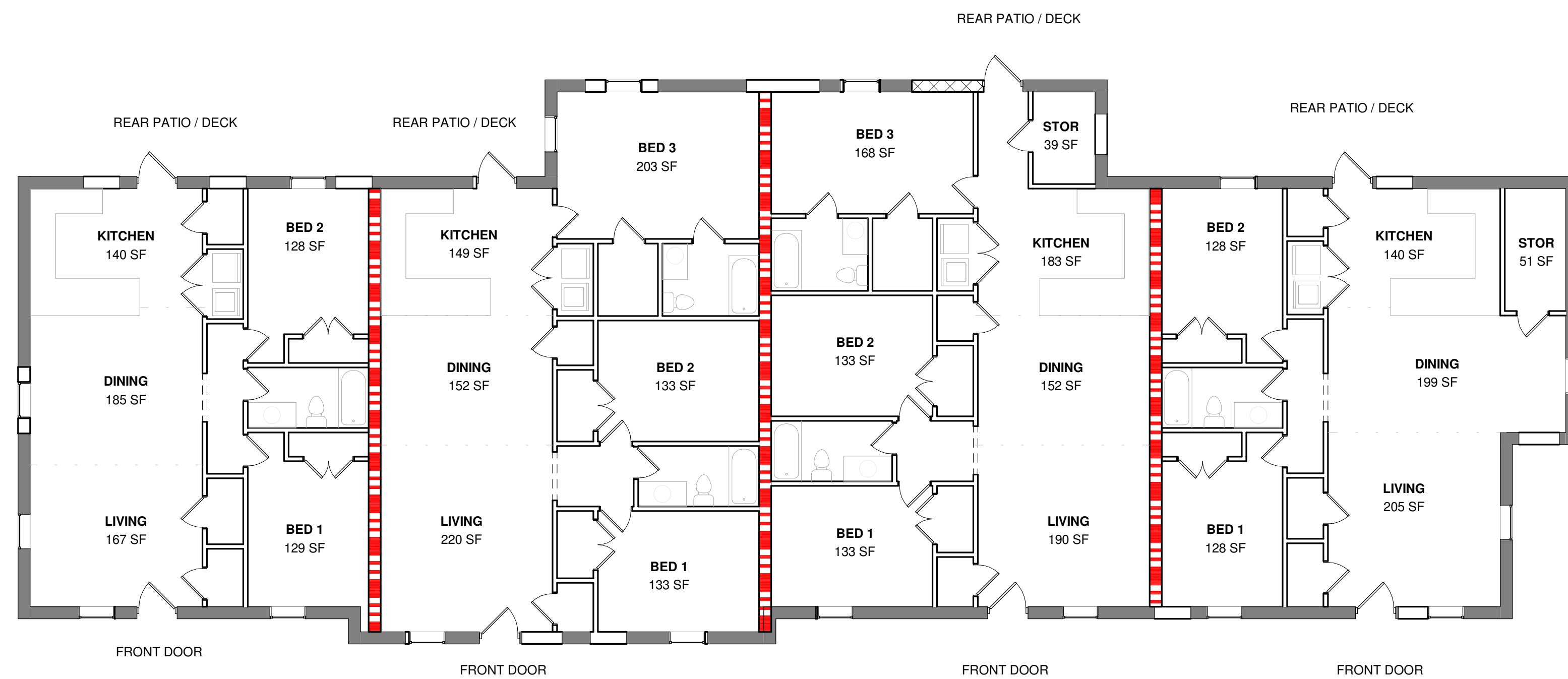
UNIT 4 966 SF 2 BED / 1 BATH